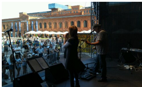
Outdoor concert at Manufaktura

outreach concerts - one in a popular club and the other in a city square that has become a hot spot in Lodz. The city welcomed us and the mayor even presented all the people who served with mementos of the city. Because of the ground that was tilled and nurtured, the church plant will soon begin. Meanwhile, Christ's presence is being made known in the hands and feet of believers serving in faith. We are so thrilled to be a small part of it and plan to return to Poland next year. If you have an interest in serving in Poland, please contact us and we'll help you get connected.